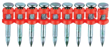
XHA premium nails for gas nailer FORCE ONE