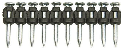
TKA standard nails for gas nailer FORCE ONE